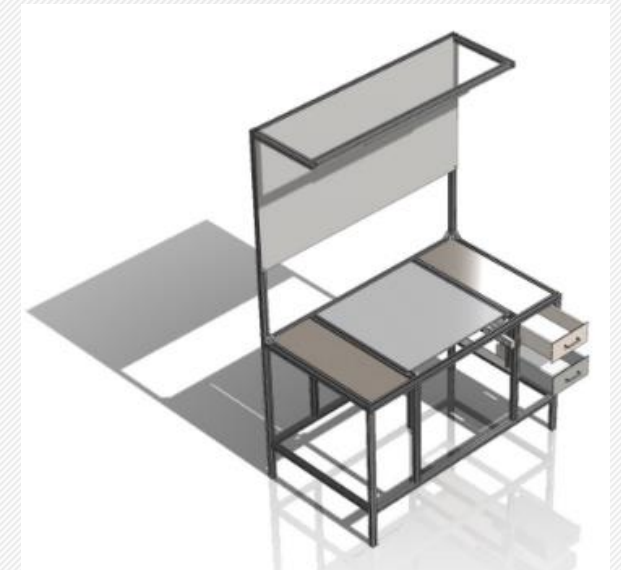
QC inspection table